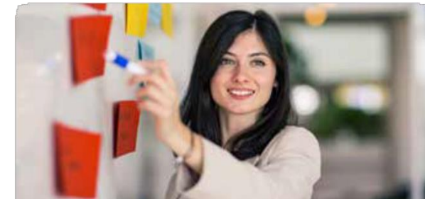
Prepared and owned by: Novo Nordisk Global People Compliance Office

Rationale for document change: The Labour Code of Conduct already includes paragraphs on leave and living wage and shall thus be updated to reflect the new leave standard and living wage policy.